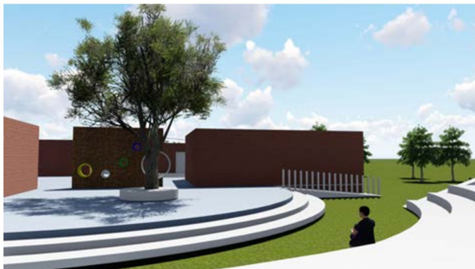
View from Mini OAT Seating area